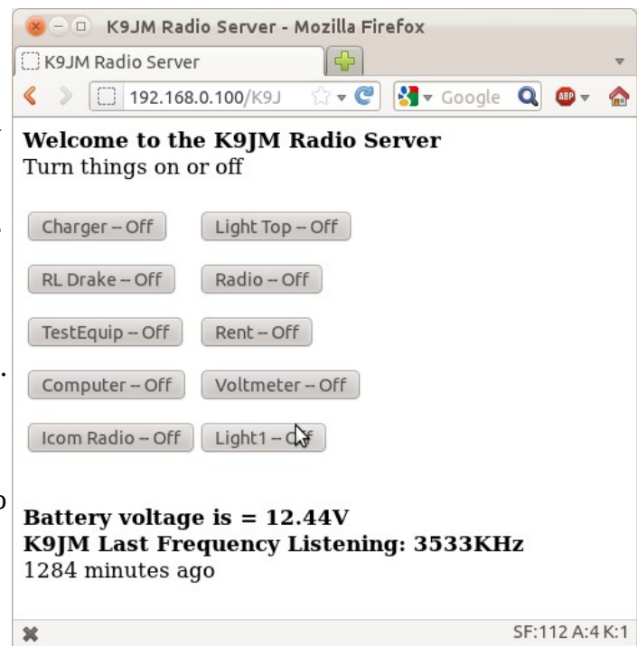
Illustration 2: Sample web page

I also built a simple Arduino based control panel. It has a simple menu structure, an optical encoder, switches and an OLED display with an Ethernet connection. This box has become the central controller for the station. sending out "quick" HTML commands to other devices over Ethernet. This device can be viewed as a hardware browser, the optical encoder and push button switches provide a more "old school" radio interface to everything. At the sametime, I still have the ability to control everything using a computer through a browser, and I can customize the controlling web pages. Another feature is that this box also acts as an NTP client, so that when not being used as a control panel, it displays the date and time (in UTC), keeping itself in sync with atomic clocks over the internet. It has become the station clock.